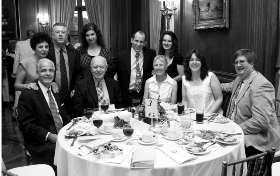
TIDES SIXTH ANNUAL HUMANITARIAN AWARD GALA held in July at the Aldrich Mansion in Warwick Neck. Pictured here are attendees enjoying the sumptuous buffet.