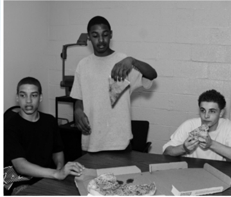
Pizza encourages peaceful exchanges in Tides Family Service’s new Conflict Resolution Program.

And there is always pizza to help get the conversation started. “The kids know they can depend on us to always be there,” Charles says, “And when we can connect with them, they begin to open up.”