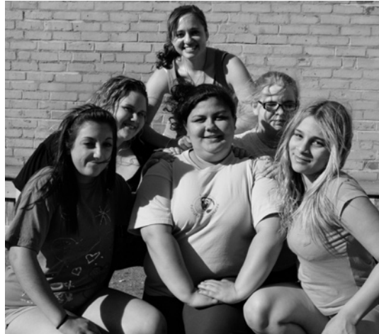
Participants in Tides' West Warwick-based Girls Group.